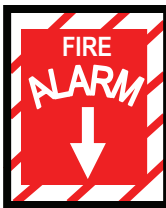
OS-F04 4 X 7 7 X 10 9 X 12