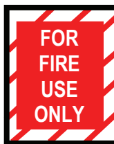
OS-F06 4 X 7 7 X 10 9 X 12