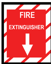
OS-F05 4 X 7 7 X 10 9 X 12