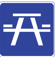
D5-5 24 x 24