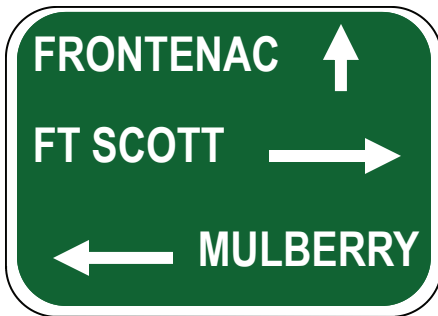
D1-3 VARIABLE LENGTH X 42