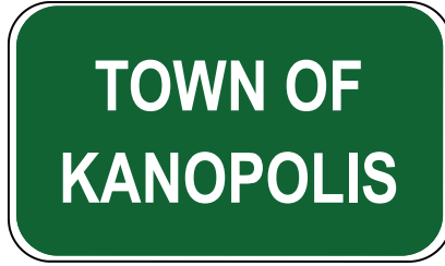
D1-1A VARIABLE LENGTH X 30