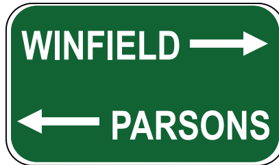
D1-2 VARIABLE LENGTH X 30