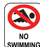
NS-88 12 X 18