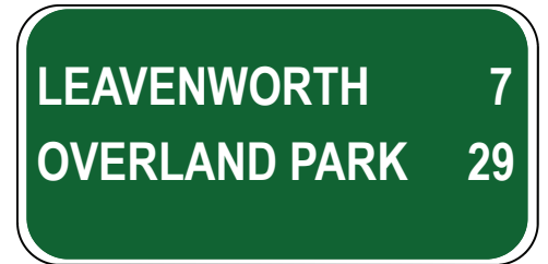
D2-2 VARIABLE LENGTH X 30