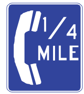
D9-1B 18 x 24 24 x 30 30 x 36