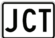
M2-1 21 X 15