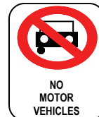
NS-87 12 X 18