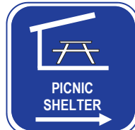
NS-80 24 X 6