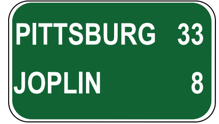
D2-2 VARIABLE LENGTH X 18