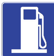
D9-7 24 x 24