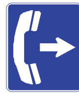
D9-1A 18 x 24 24 x 30 30 x 36