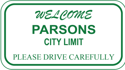
N-12 48 X 36