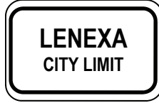
N-14 24 X 12