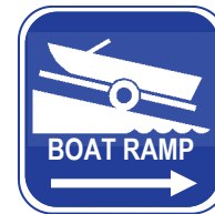
NS-81 24 X 6