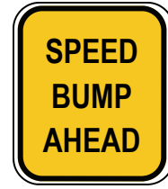
N-20 12 X 18 18 X 24