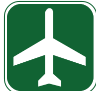
I-5 24 X 6