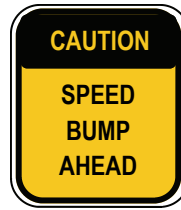
N-19 12 X 18 18 X 24