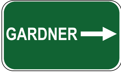
D1-1 VARIABLE LENGTH X 18

THESE SIGNS MAY BE VARIED IN SIZE TO MEET YOUR NEEDS