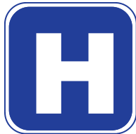
D9-2 24 x 24