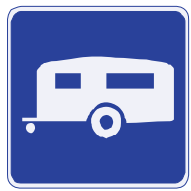
D9-4 24 x 24