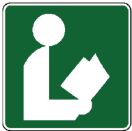
I-8 24 x 24