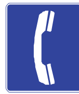
D9-1 24 x 24